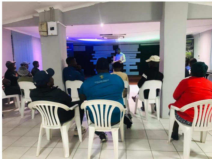
Raising a Quality Men Session