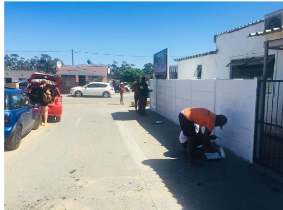
Waumbe Facelifting Project