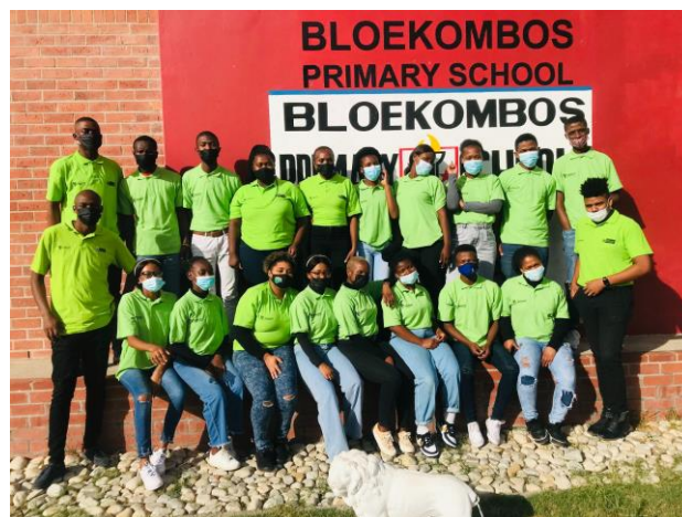
Yearbeyond Facilitators 2021