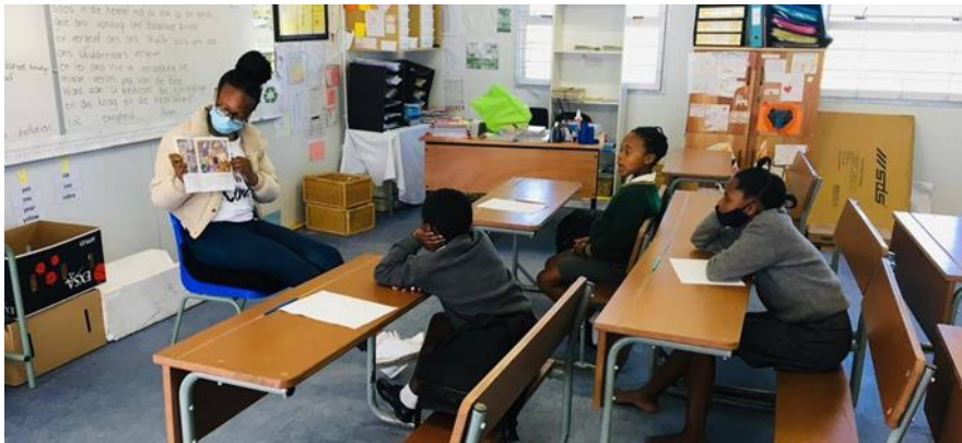
Yearbeyond Facilitator teaching literacy to grade 3 learners 2021