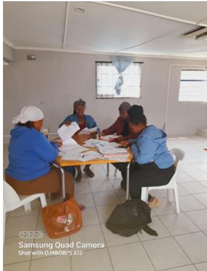
2021- Matric Rewrites attending Tutoring session