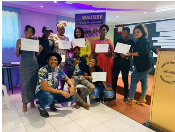
Unemployed Youth Graduation Ceremony